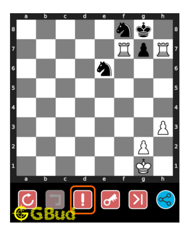
Figure 7: Click the help button to get help on next move @ https://gbud.in/gv6vcj1