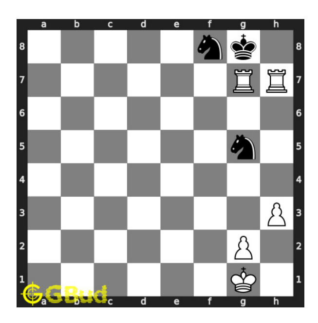
Figure 5: Rfxg7# - Since the support of the knight to g7 is removed, the rook moves in and had a checkmate. This is called Blind swine mate